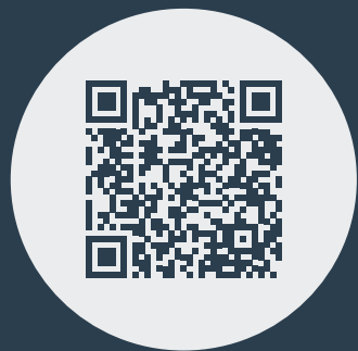
Follow us on LinkedIn